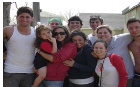
Students taking a break from work last year in New Orleans.