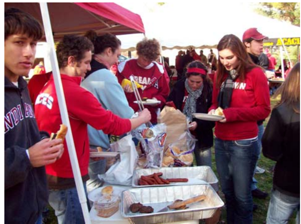
Students enjoying themselves at the IU Hillel 2008 Homecoming tailgate!

Hillel 730 E. Third Street Bloomington, IN 47401