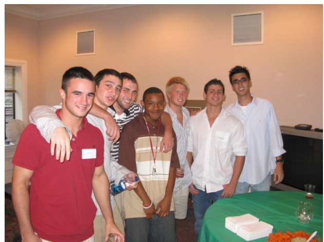
Intensive Freshmen Summer Seminar students hanging out during the IFS Shabbat.